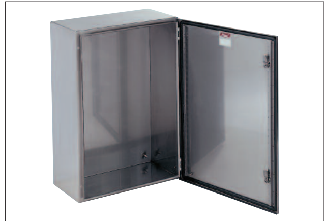
Stainless Steel Wall Mounted Enclosure.