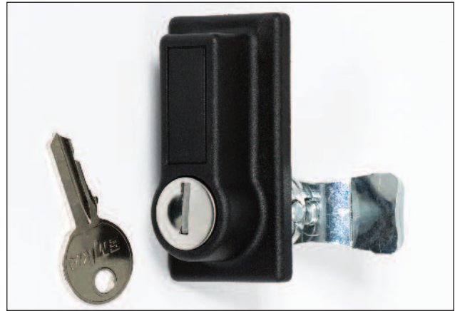
Lock to suit Stainless Steel Enclosures.

A range of locks to suit the NSYS3X stainless steel enclosures.