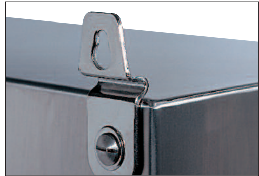
Wall Fixing Kit.

Manufactured in 304 grade stainless steel. Fitted from the outside. Can be mounted vertically or horizontally.