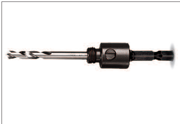
For the range of Arbors to suit. See pg 43