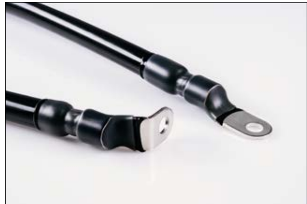
Heat shrink tubing SA47-LA for cable connection.