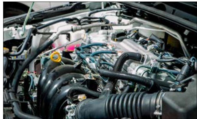
SA47-HT provides optimum protection against moisture in high temperature applications.

SA47 has been developed with our Automotive partners to eliminate the risk of corrosion around cable splices and terminations.