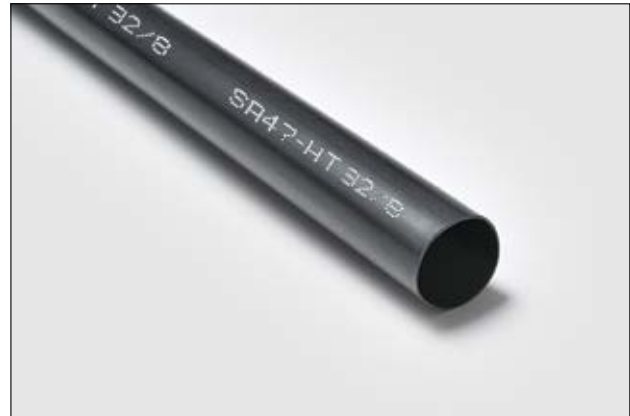
Heat shrink tubing SA47-HT for 150°C application.