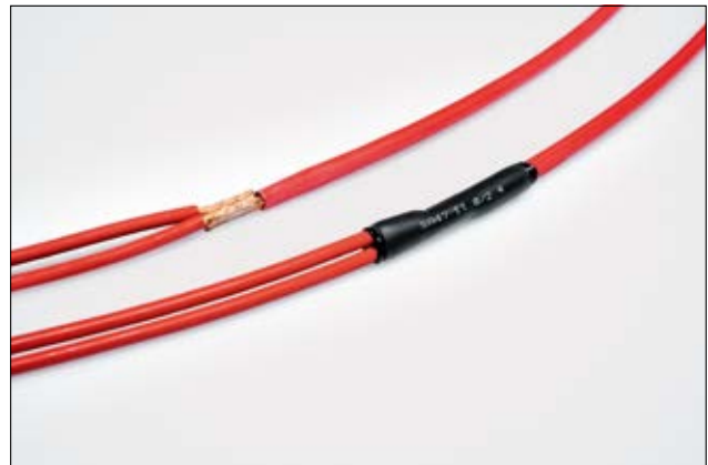
Heat shrink tubing SA47 for splice application.